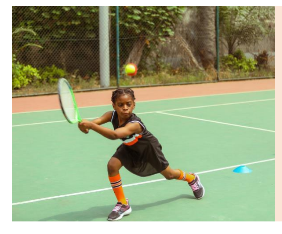
Talent Identification & Development: Scouting and specialized training.