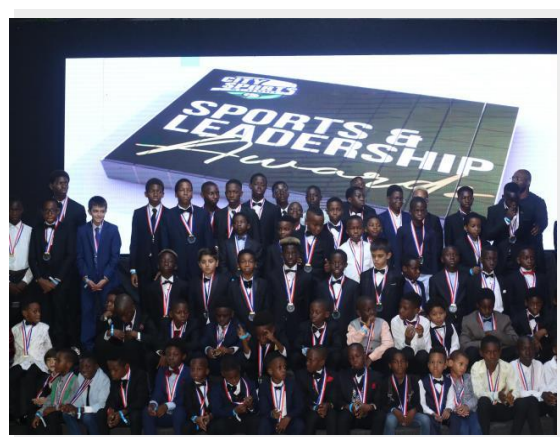
Scholarships & Bursaries: Financial support for talented athletes.