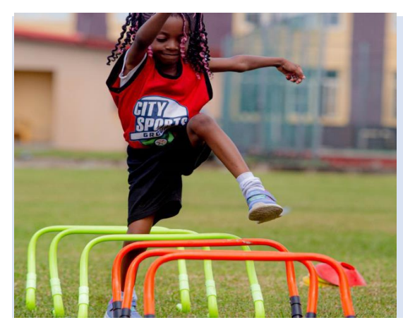
Mass Participation Programs: Sports festivals, inter-school competitions.